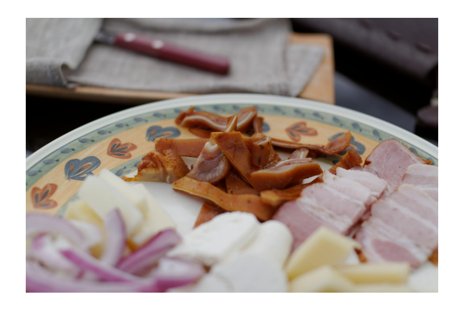
Figure 3.1: Smoked pig's ears