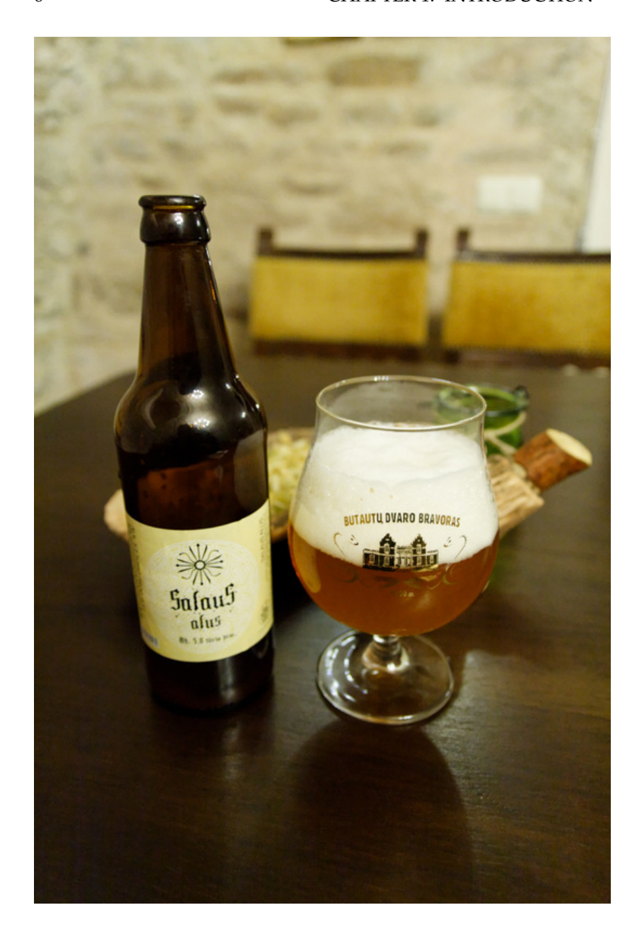
Figure 1.1: Kupiškio Salaus Alus