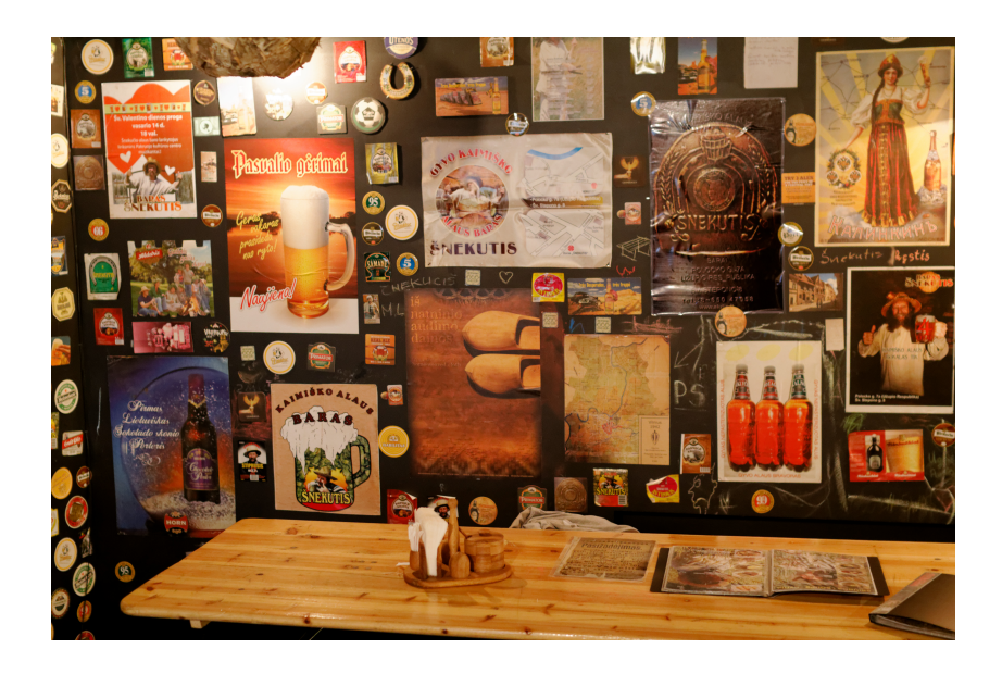
Figure 7.8: Decorations at Šnekutis Mikolajus

at the back is very nice (and always full in summer). The beer menu, unfortunately, is deeply confusing.