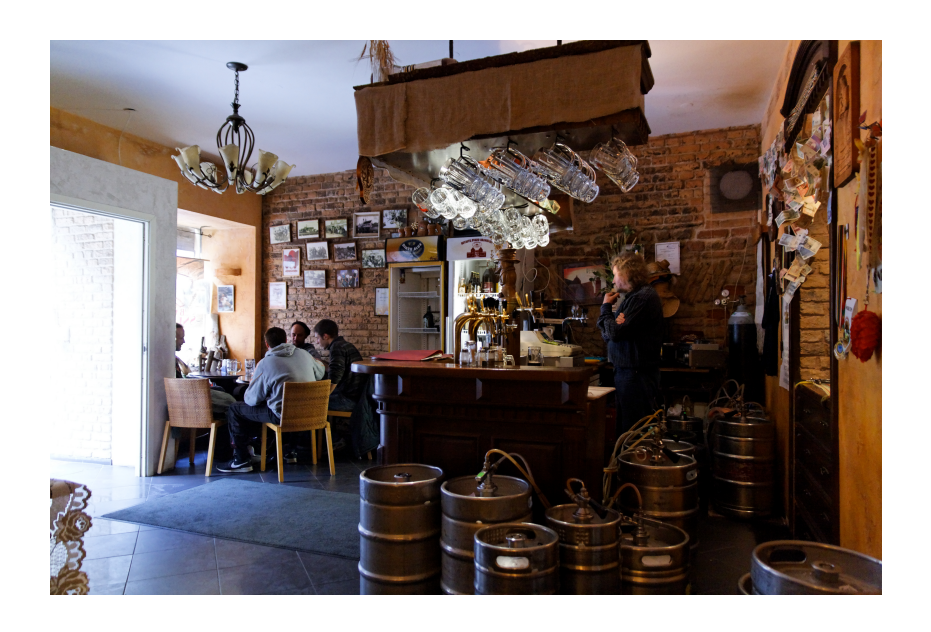
Figure 7.3: The bar at Šnekutis Stepono