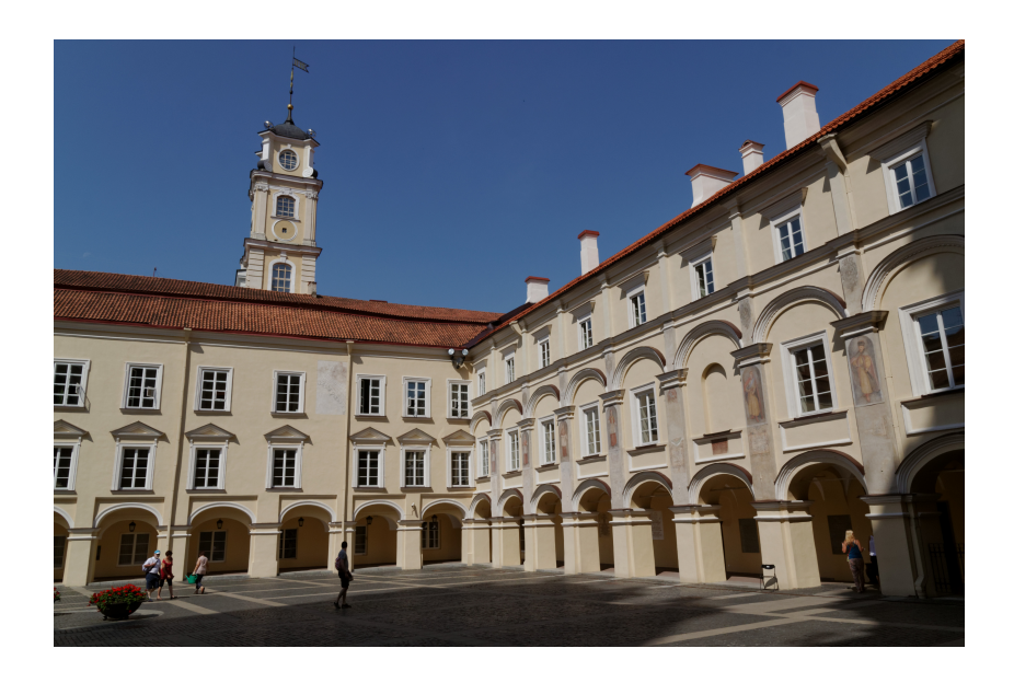
Figure 7.1: The Great Courtyard of Vilnius University

of these breweries have employees who speak English, which makes things difficult. If you know someone in Lithuania who can translate that will make things much easier.