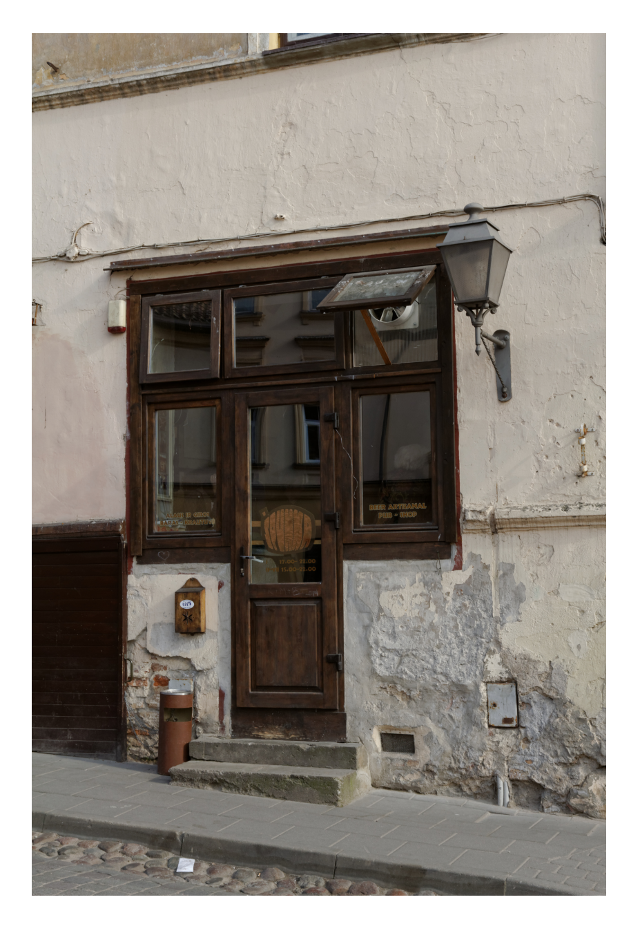
Figure 7.6: Špunka