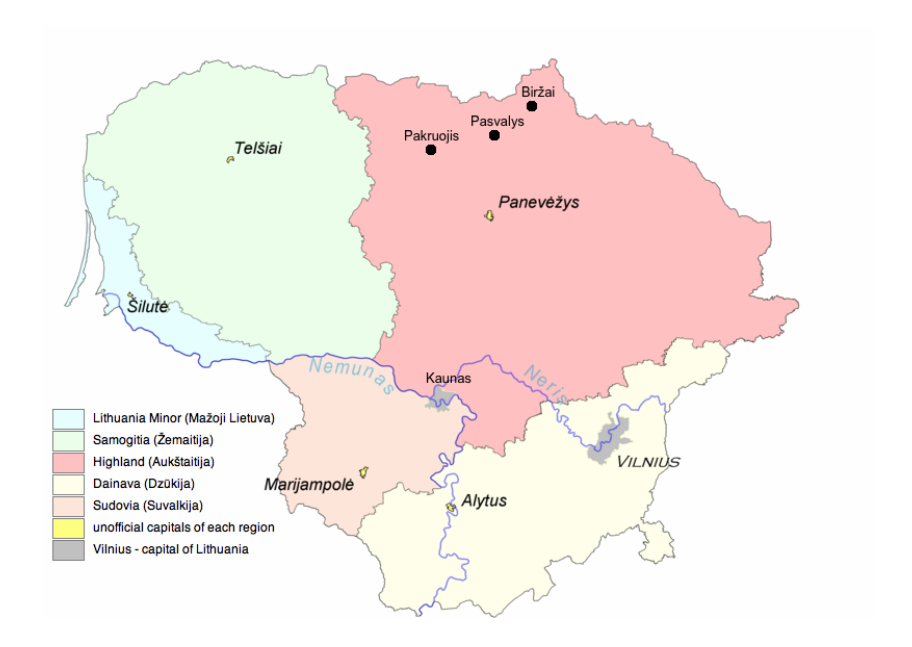
Figure 5.1: Lithuanian regions