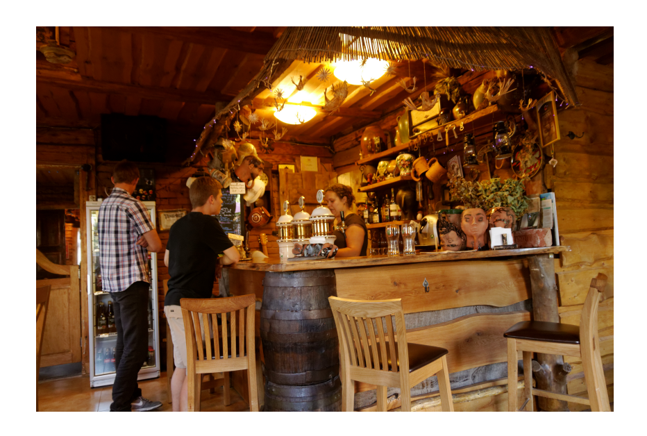
Figure 7.10: The bar at Prie Uosio