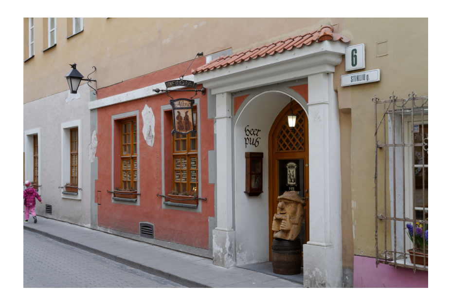
Figure 7.7: Alinė Leičiai