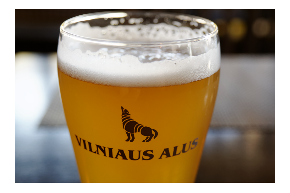
Figure 2.2: Vilniaus Kvietinis