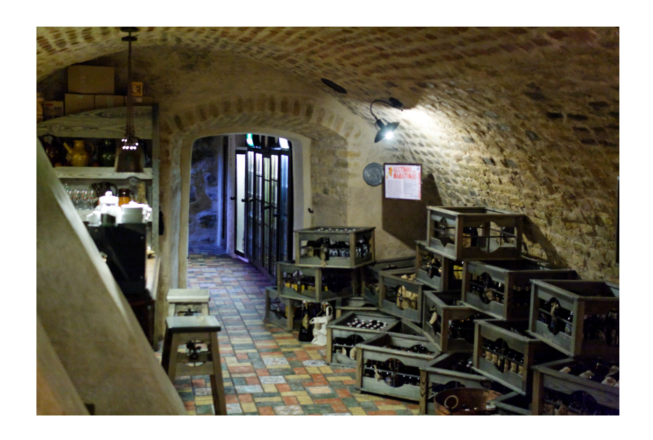
Figure 7.4: The shop part of Bambalynė