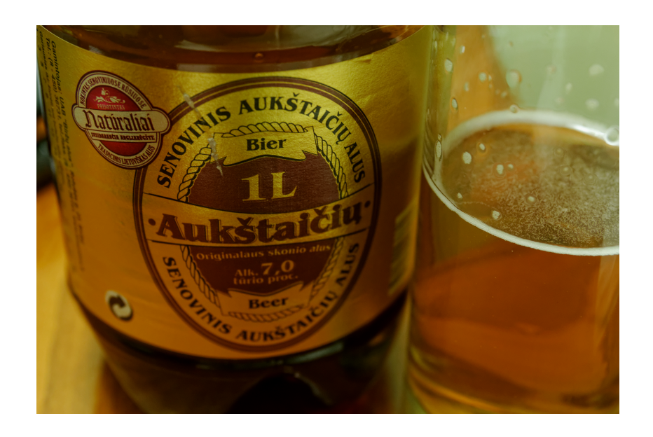
Figure 2.1: A šviesusis from Biržu Alus