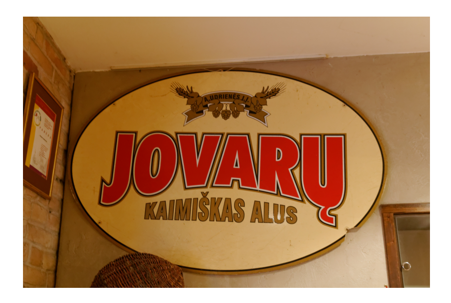
Figure 2.3: Jovaru Alus sign at Šnekutis