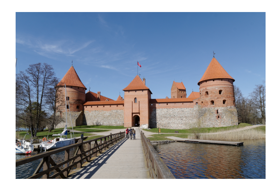
Figure 7.9: Trakai island castle