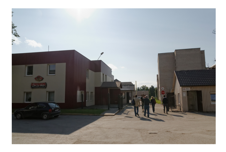
Figure 6.3: Entering Biržu Alus