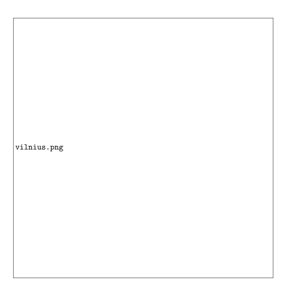
Figure 7.2: Map of Vilnius