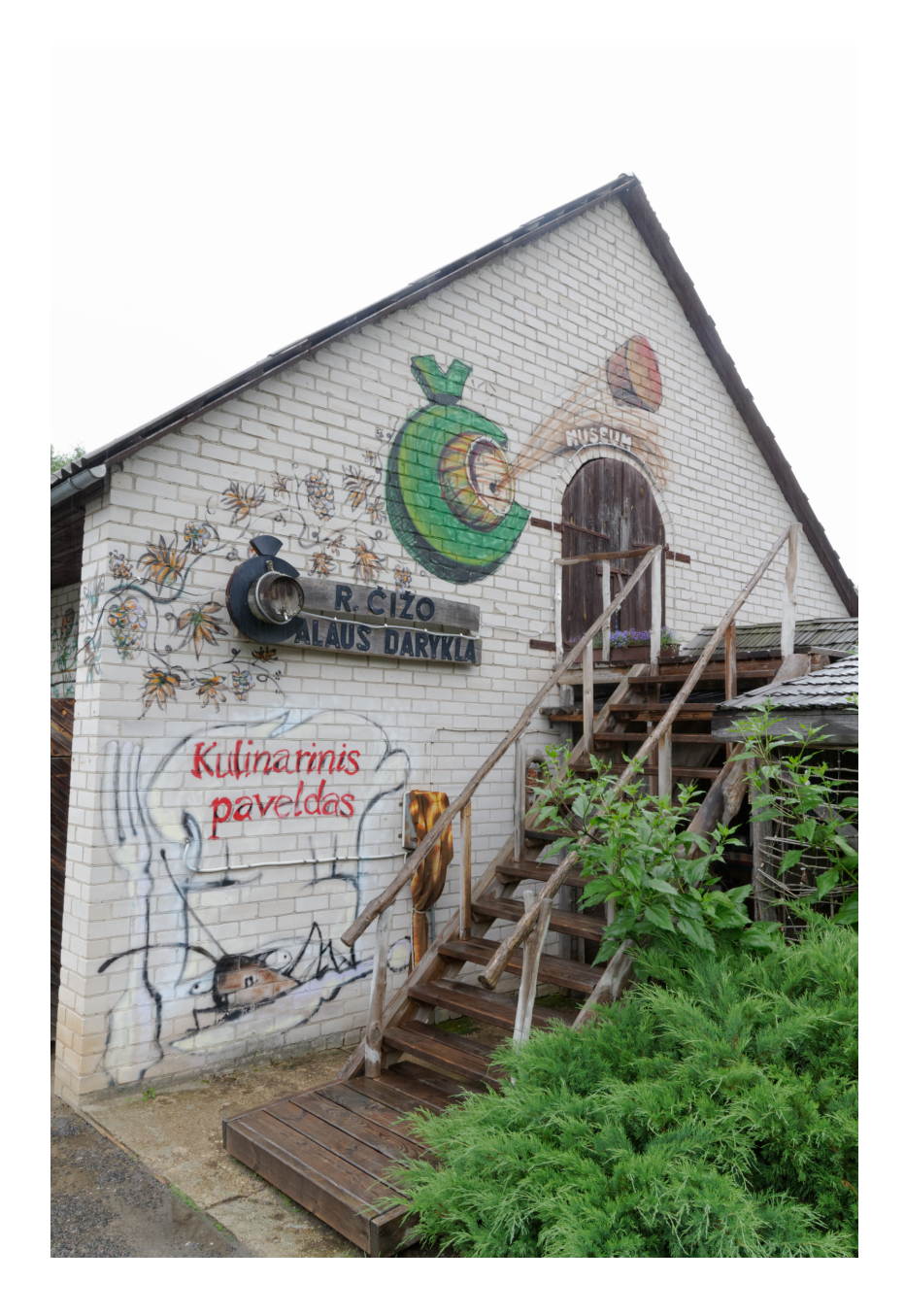
Figure 6.1: Ramūno Čižo Alaus Darykla, Dusetos